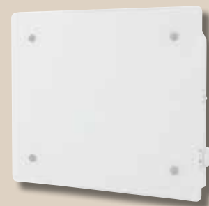
Eco Basic panel heater with glass surface. Hight 328 mm