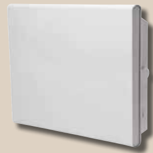
Eco Basic panel heater. Hight 330 mm